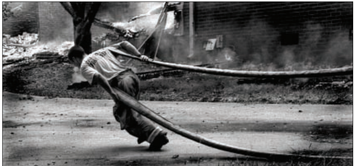
Darie C. Lapp The Fire Within Black & white film, 9" x 18"