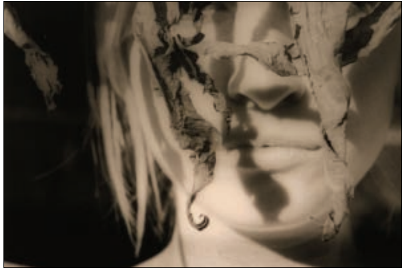
Tara Love Hide-n-Seek Silver gelatin print, 8" x 10"